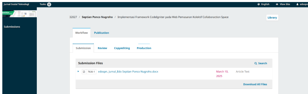
Gambar 2.8. Halaman Daftar Submit