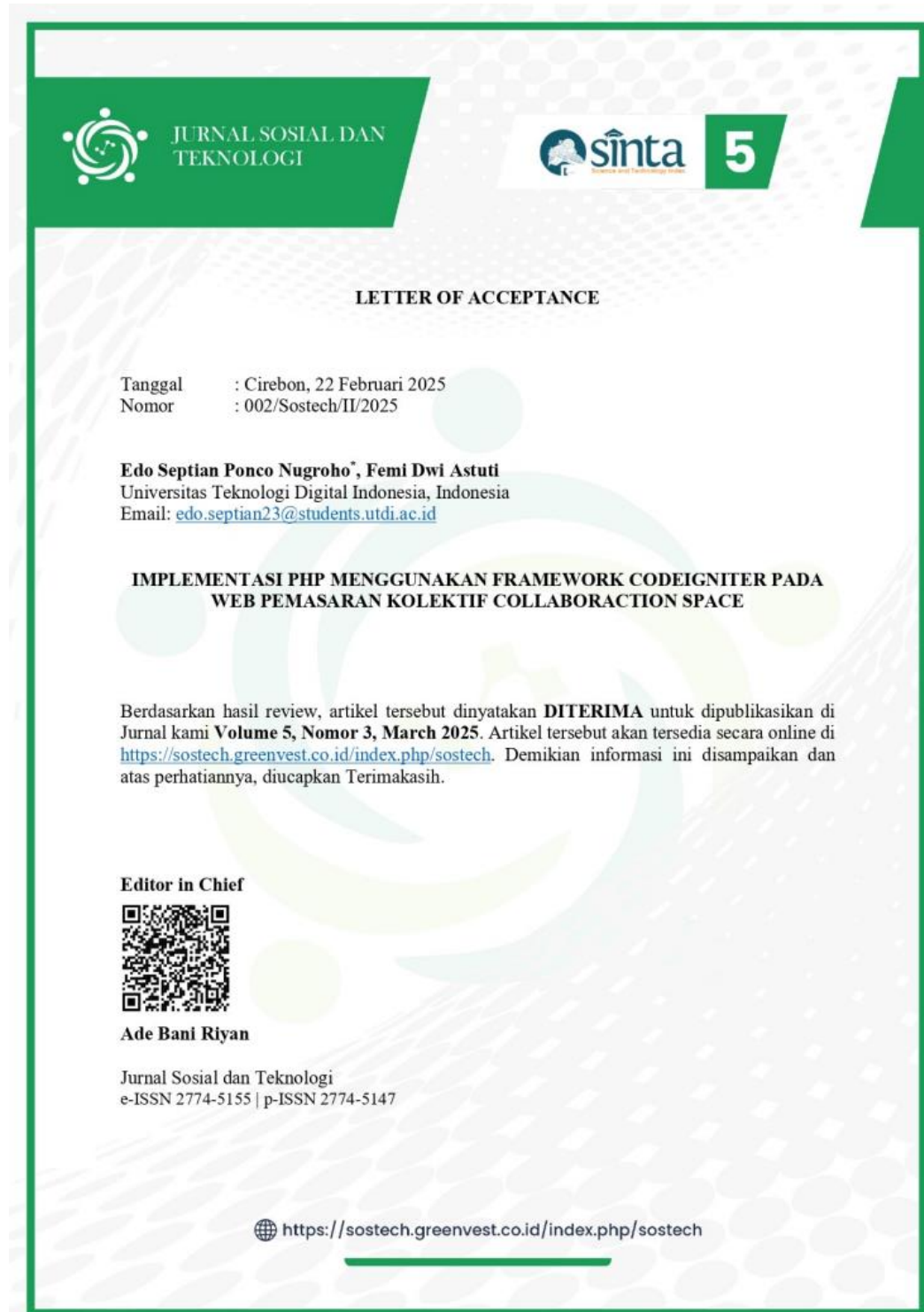
Gambar 2.9. Letter of Acceptance Jurnal Yang Sudah Di Submit