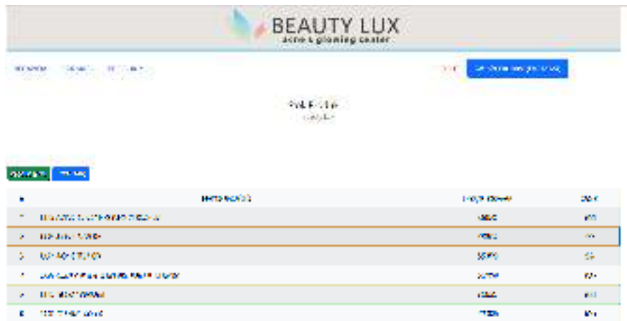
Gambar 4.7 Hasil Lihat Stok